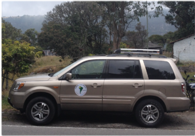
Transport: SUV, 4x4 with air conditioning

Packing list essentials: copy of passport, comfortable non-slip shoes, local currency for beverages/snacks, sun protection, rain protection, insect repellent, swimsuit, towel & sandals for the shower.