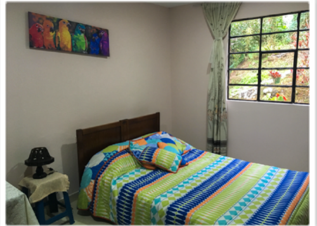
Accommodation: Rural farmstay with double beds & exterior warm showers

US $250 per person (group size 2-6 people)