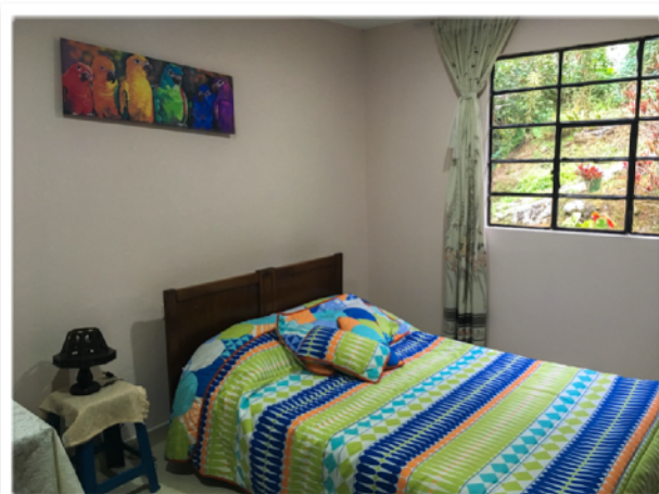
Accommodation: Rural farmstay with double beds & warm showers

US $390 per person (group size 2-6 people)