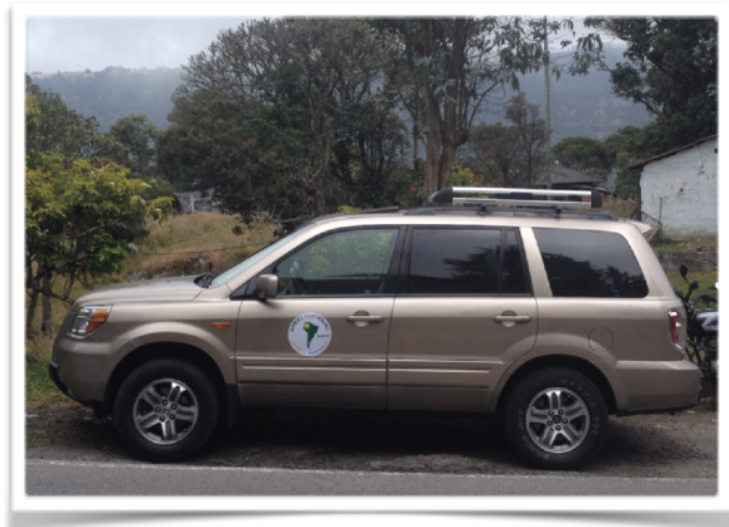
Transport: SUV, 4x4 with air conditioning

Packing list essentials: copy of passport, comfortable non-slip shoes, local currency for beverages/snacks, sun protection, swimsuit, insect repellent & sandals for the shower.